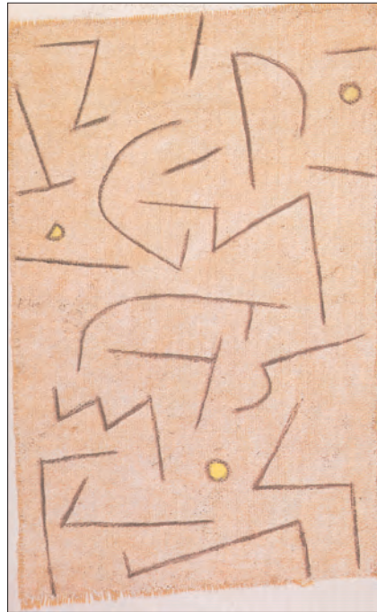
PAUL KLEE: HARMONISIERTE STÖRUNGEN. 1937

❑ contribute to co-ordination of consultations between researchers and different public institutions, business organisations, and NGOs.