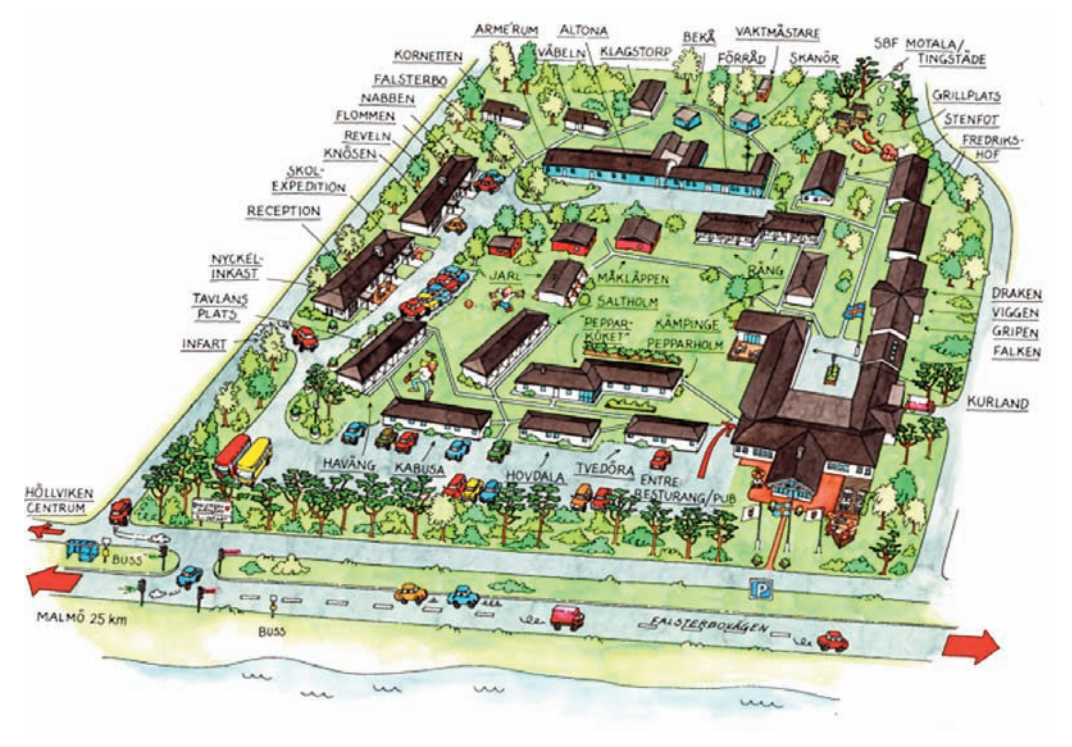
Map of Falsterbo kursgård in Höllviken, the conference venue

Please note that there is an indoor swimming pool, so bring your bathing suits!